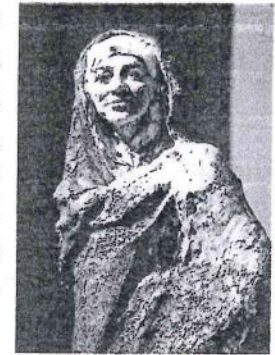
Mary Ward - bronze statue

the courage to remain utterly loyal to the Church, yet at the same time true to the mission she was convinced of having received from God. She was made of steel, one would feel, in meeting resistance and threats outside, as well as in facing discouragement and lukewarmness within. Within her was a fire for God and His Cause. It is this fire that made her what she was in her lifetime.