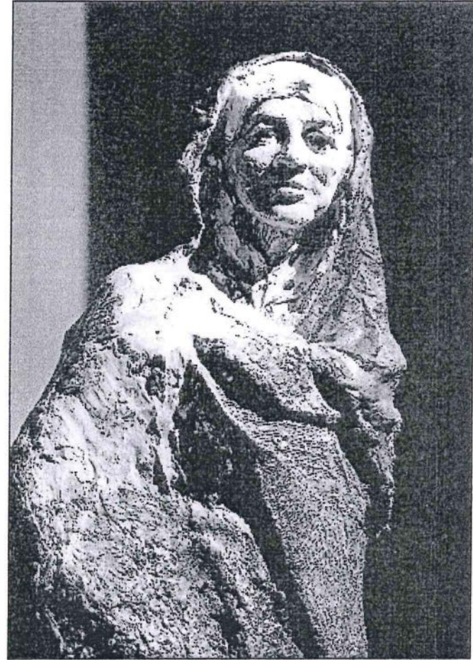
Journeying With Mary Ward